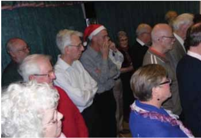
Our choir at Farcroft