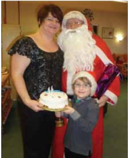
“So, who’s 80 then?”