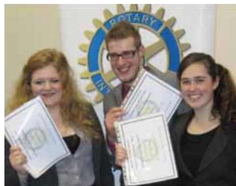
Runners up team (William Brookes School, Much Wenlock) at Youth Speaks, Charlton School, 24th February