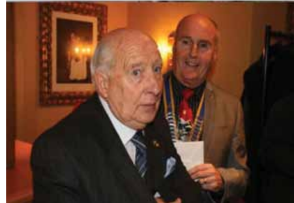
“No, it wasn’t me guv’nor”