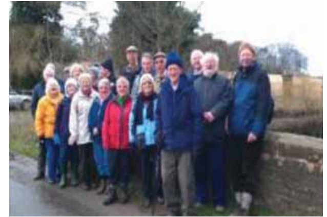
The Great Walkers (p 4)